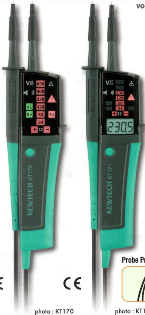
photo : KT170