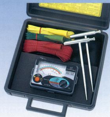
MODEL 4102A-H (Hard Case Model)